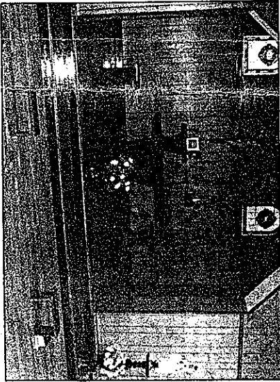
THE CHAPEL at the Mother of God convent, New Bedford, reflects the simplicity with which the sisters live. The small benches on the floor were made by the group and the altar, a tree stump, serves well for daily Mass.